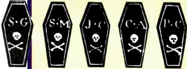
Coffins of massacre victims

Could a picture change history? Paul Revere's engraving of the Boston Massacre, below, may not have caused the American Revolution. But it played a major role in whipping up colonial fury against the British.