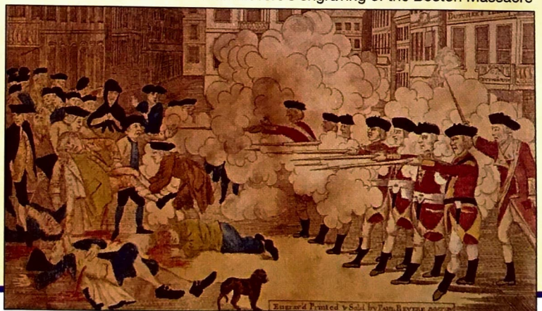
Paul Revere's engraving of the Boston Massacre