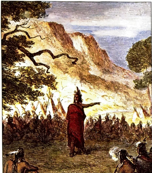
Ottawa War Council Chief Pontiac led Native Americans against the British in the Ohio Valley. Here, Pontiac addresses a war council in 1763. Economics For what uses did the British want Indian lands?

the treaty marked the end of French power in North America. As a result, the Indians could no longer hope for French aid against the British. One by one, the Indian nations stopped fighting and returned home. "All my young men have buried their hatchets," Pontiac sadly observed.